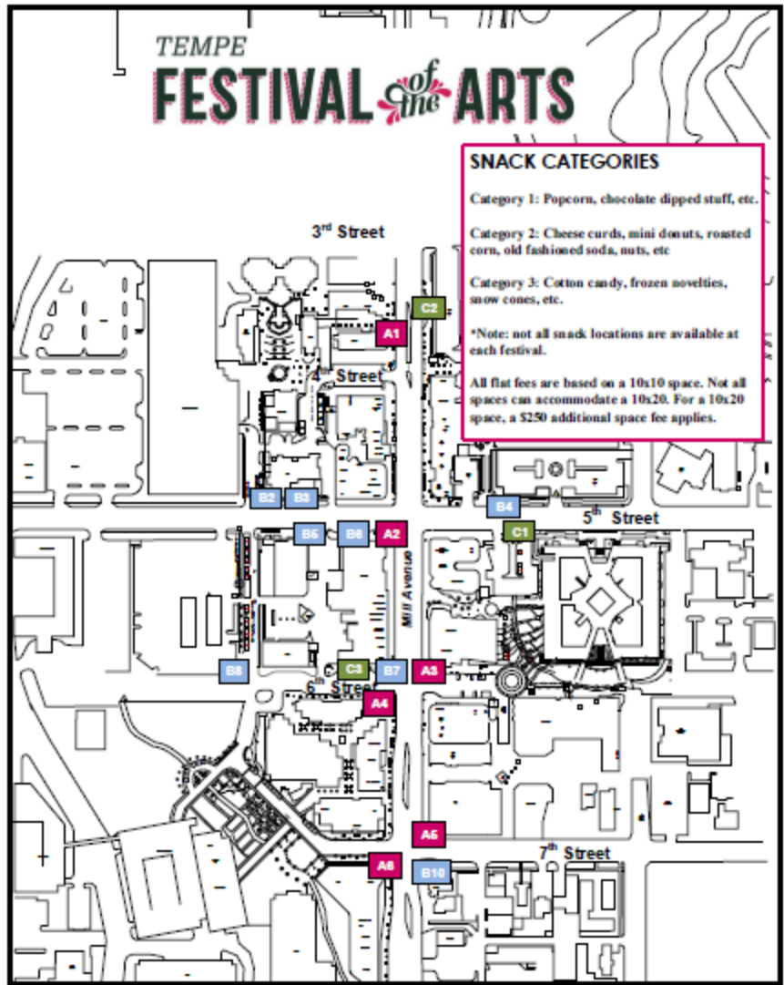
Snack & Beverage Map